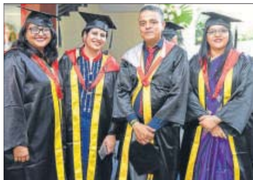
Proud faculty members of IMT Ghaziabad