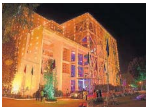
IMT Ghaziabad campus all lit up during Convocation 2018