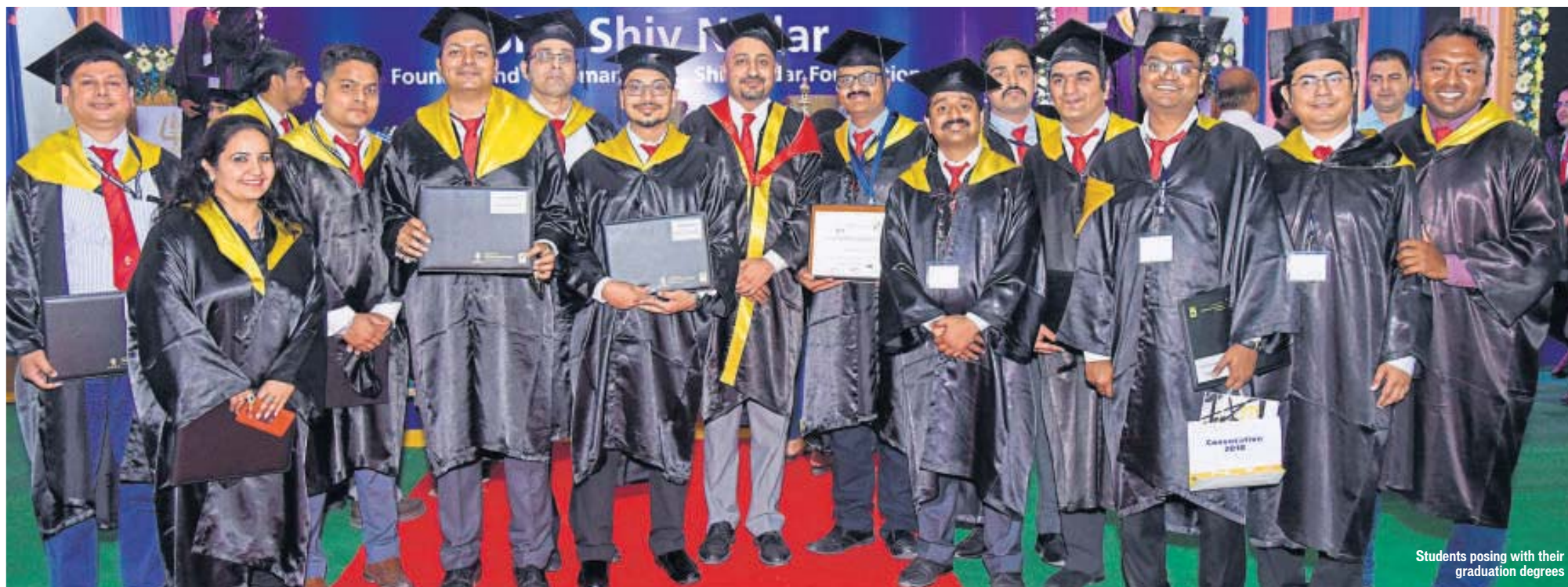
Students posing with their graduation degrees