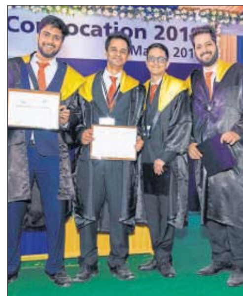
Students posing with their graduation degrees