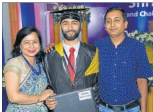
A student sharing the proud moment with his family