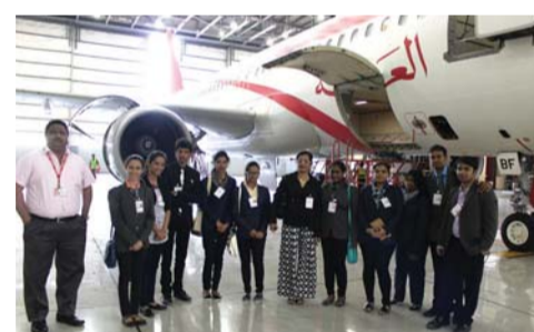
International Immersion Program at UAE

SVIMS along with its partners Success TryAngles and Shine.com organises Mumbai Mega Job Fairs every year. Corporates compete for participation in these events. This benefits