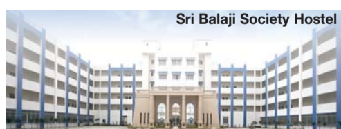
Sri Balaji Society Hostel

'How to stand up to the expectations of students? How to stand up to the expectations of parents?' These are the main questions on which the authorities in Sri Balaji Society, Pune always exercise their minds and devote their entire time, energy, efforts and resources to build the career of their students. Blessed with the best facilities, infrastructure, in-built systems and processes, the Management Institutes of Sri Balaji